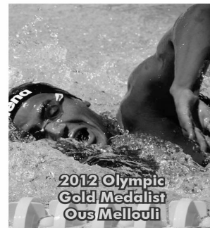
2012 Olympic Gold Medalist Ous Mellouli